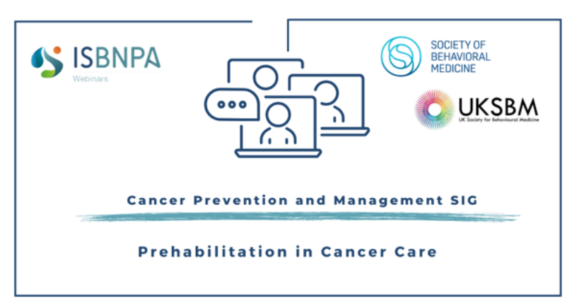
April 19, 13:00 UTC

Cancer Prevention and Management SIG of ISBNPA, Physical Activity SIG of the Society of Behavioral Medicine (SBM), and Cancer SIG of the UK Society for Behavioural Medicine (UKSBM) Joint Webinar